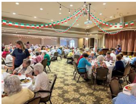
"Un Buon Momento!" (A good time). Our Italian dinner night was a great success. Read all about it on the next page!