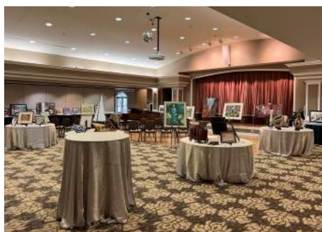
We hope everyone enjoyed looking at the lovely art for the Art Show. There is so much talent here at The Village!