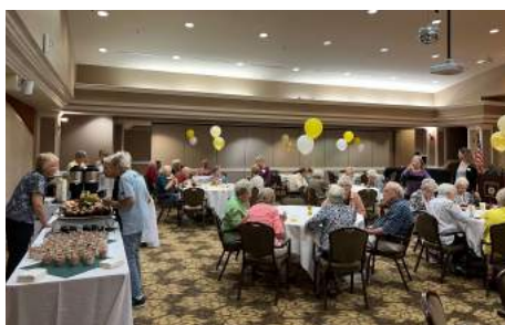
Our summer Meet & Greet. The fall Meet & Greet will be Wednesday, October 5th, at 4 pm and will be a cocktail hour this time!