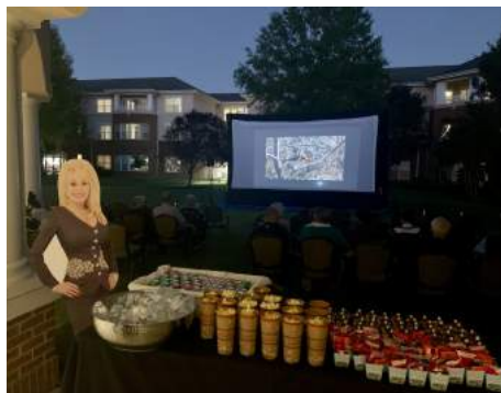
Dolly Parton visited our outdoor movie night during Active Aging Week.