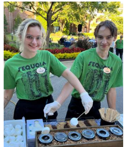
Our awesome servers making s'mores for our Great Outdoors party during Active Aging Week.