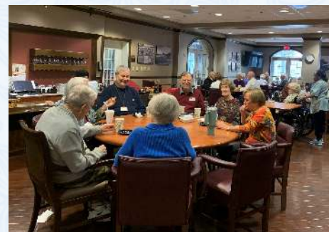
Who doesn't love donuts and coffee?! Pictured: Residents enjoying a Saturday morning chat with friends while enjoying donuts and a cup of coffee.

Male resident at dinner in the Monarch: "I have a great new way to cut my toenails." Wife: "Stop talking NOW!"