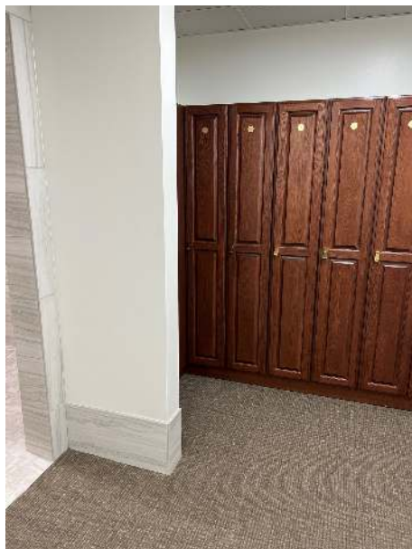
The gorgeous new lockers!

A putting green has been our residents' most-requested recreational amenity for many years. We have been planning and building the green for the last several months and it is now open and ready to be enjoyed. The green was designed by a professional landscape architect and you will be pleased with its quality. The putting green has four holes with a no-stooping-required ball retrieval system. It is located in our main courtyard and is a beautiful enhancement to that area. The Village has a number of golfers living here, so I know the putting green will be put to good use. For the rest of us, we will enjoy the beautiful setting of being on a golf course.