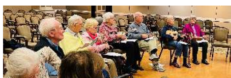
Ukulele class has taken off!