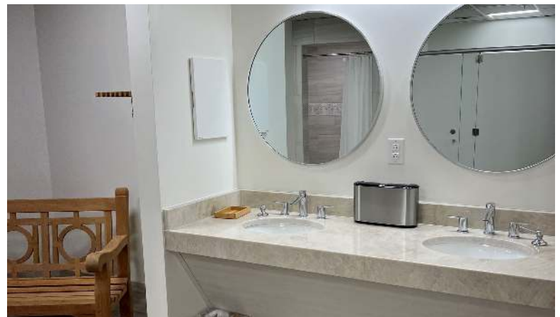
A look at the women's locker room!